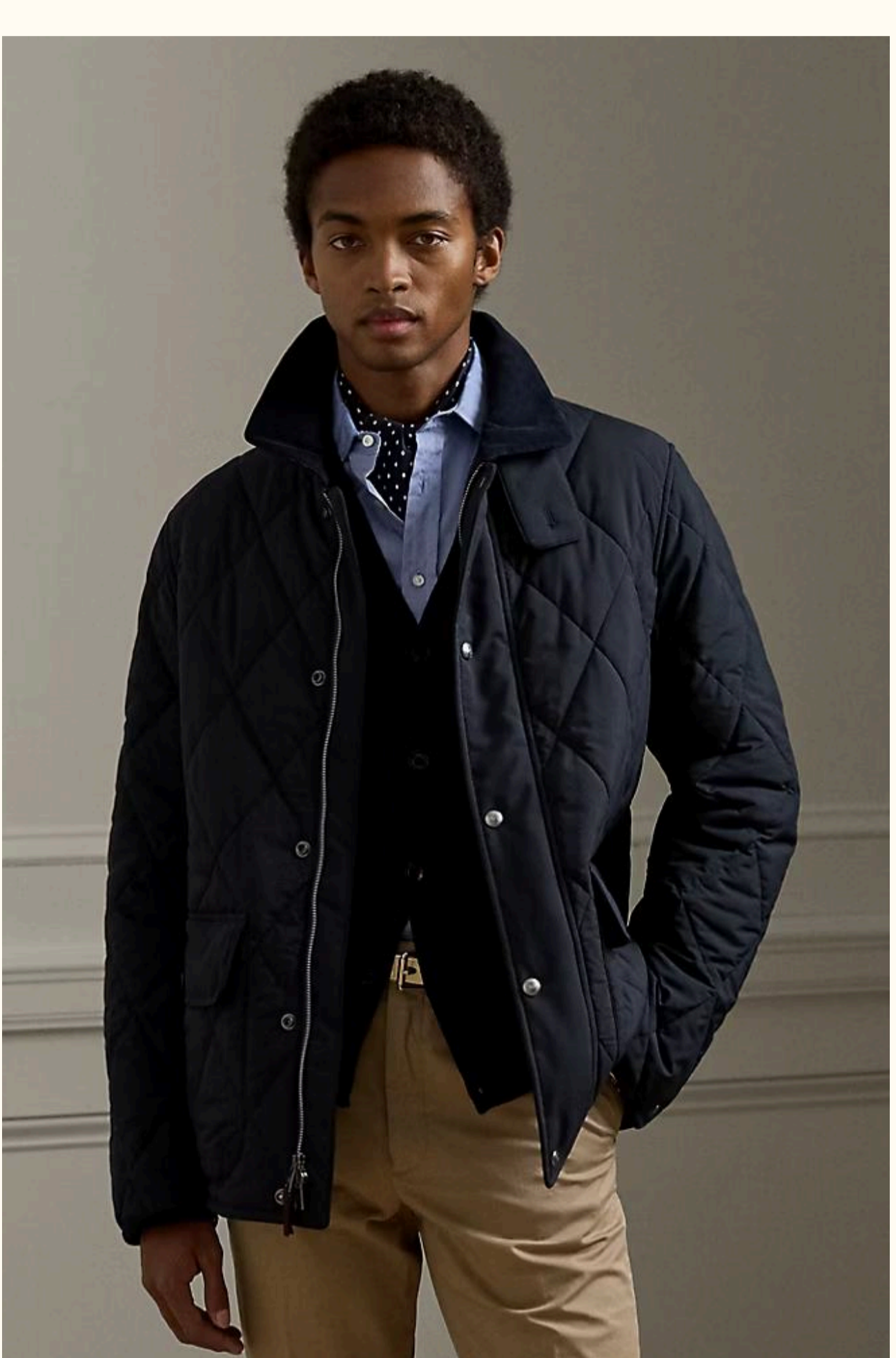
CARLETON QUILTED DOWN JACKET €2.750,00