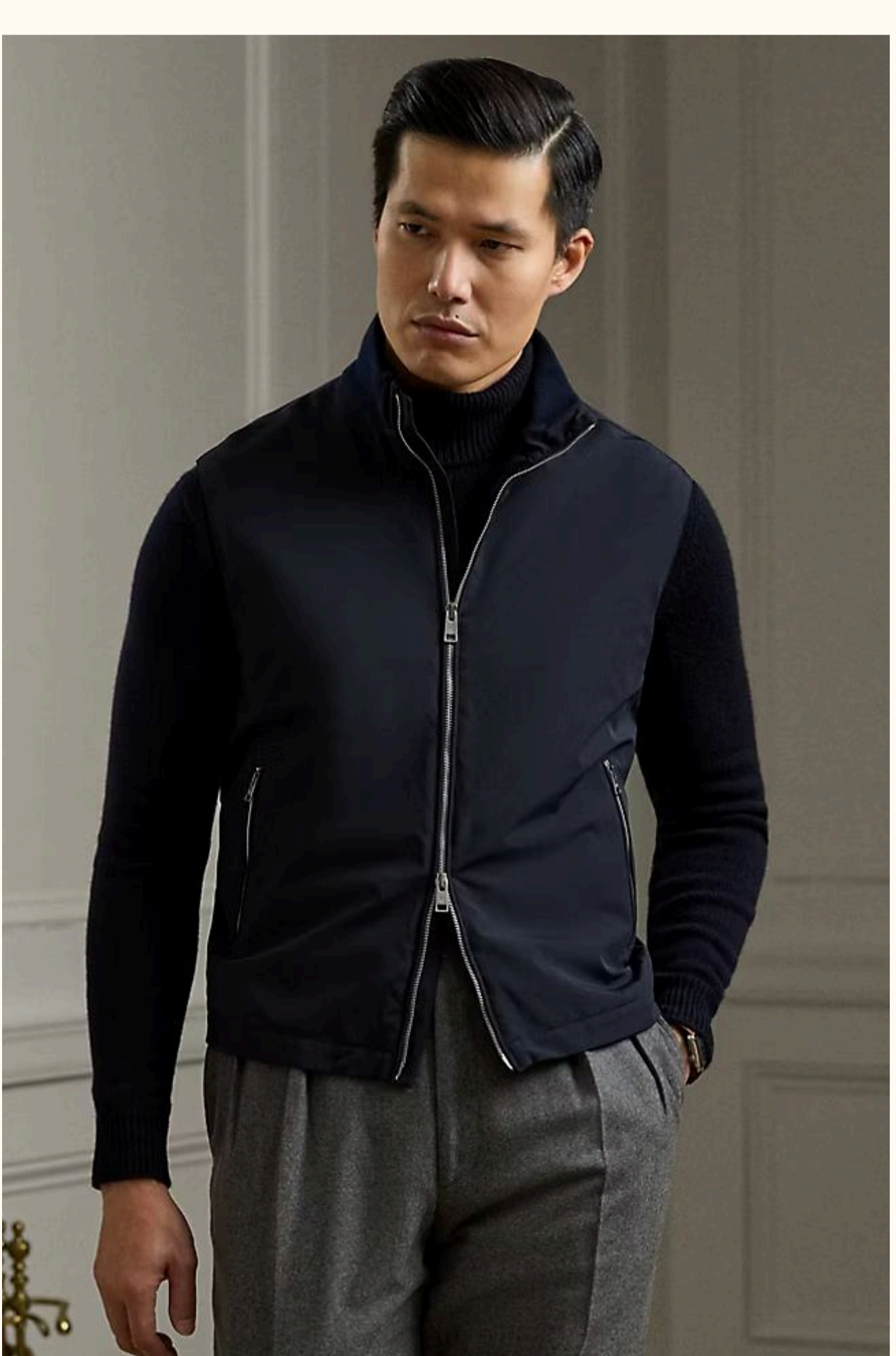
JEFFRIES STRETCH WAISTCOAT €1.950,00