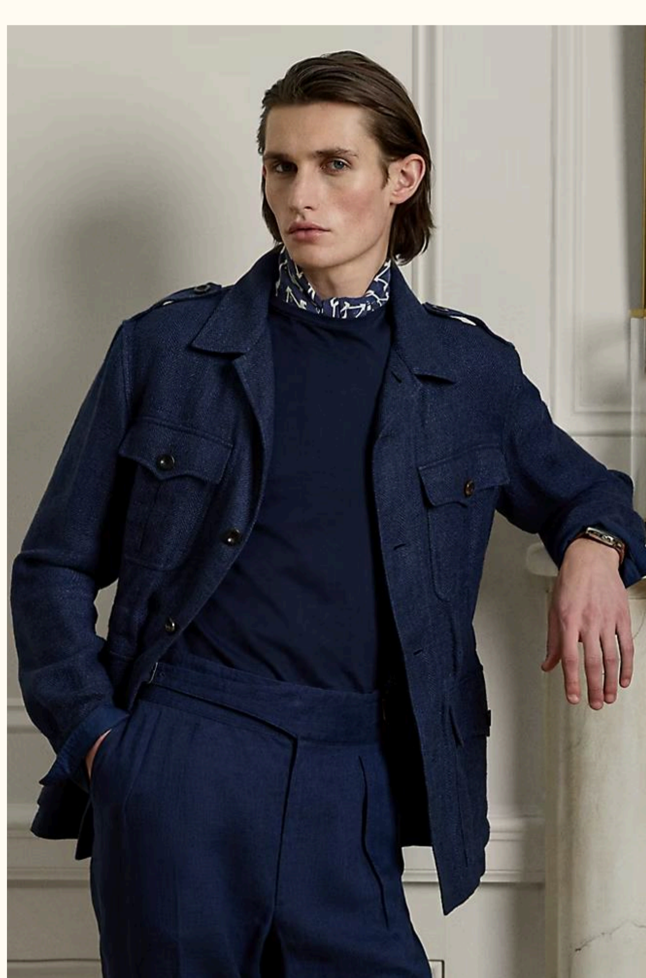
HAND-TAILORED LINEN-BLEND JACKET €2.750,00