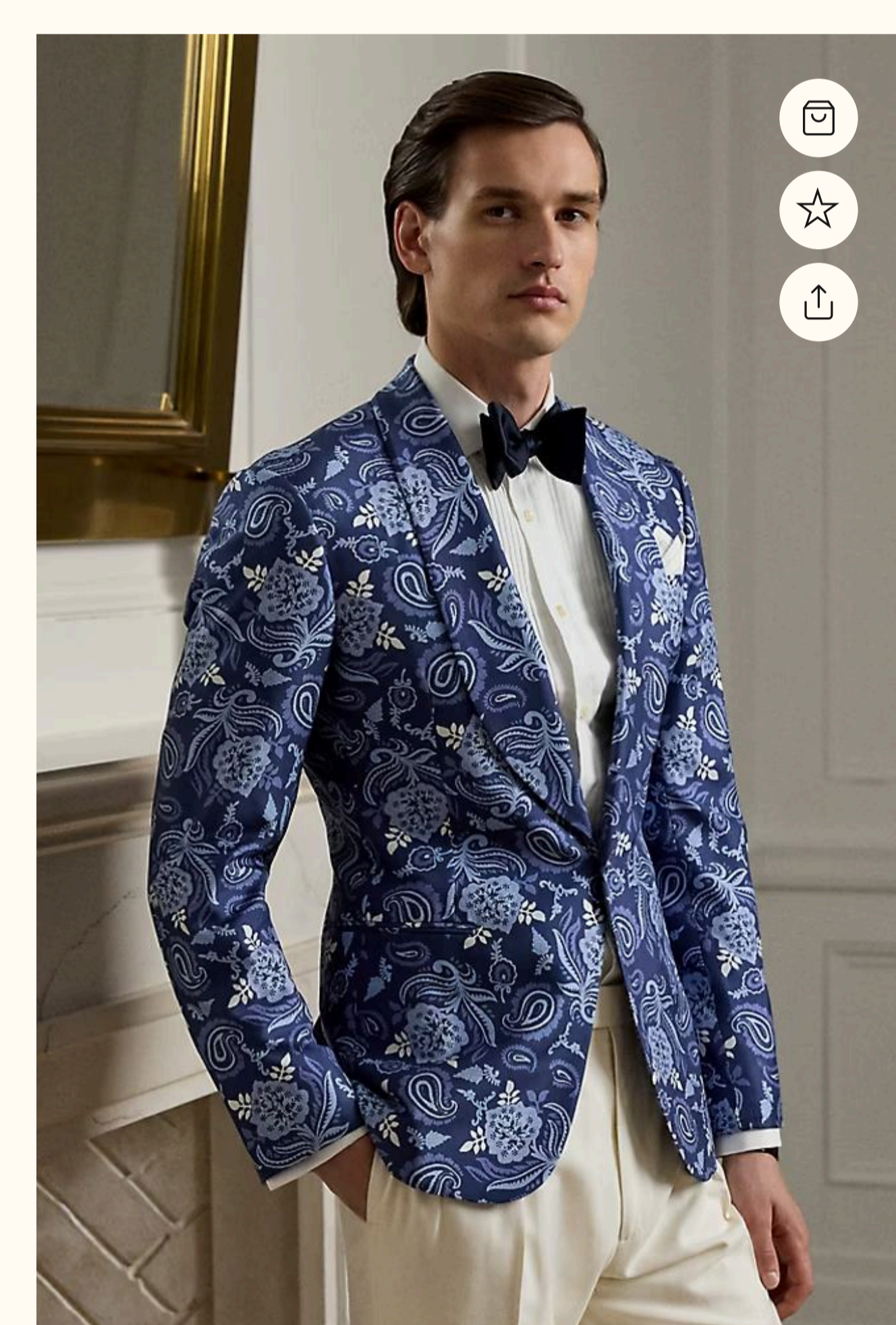
KENT HANDMADE PAISLEY SILK JACKET €4.950,00