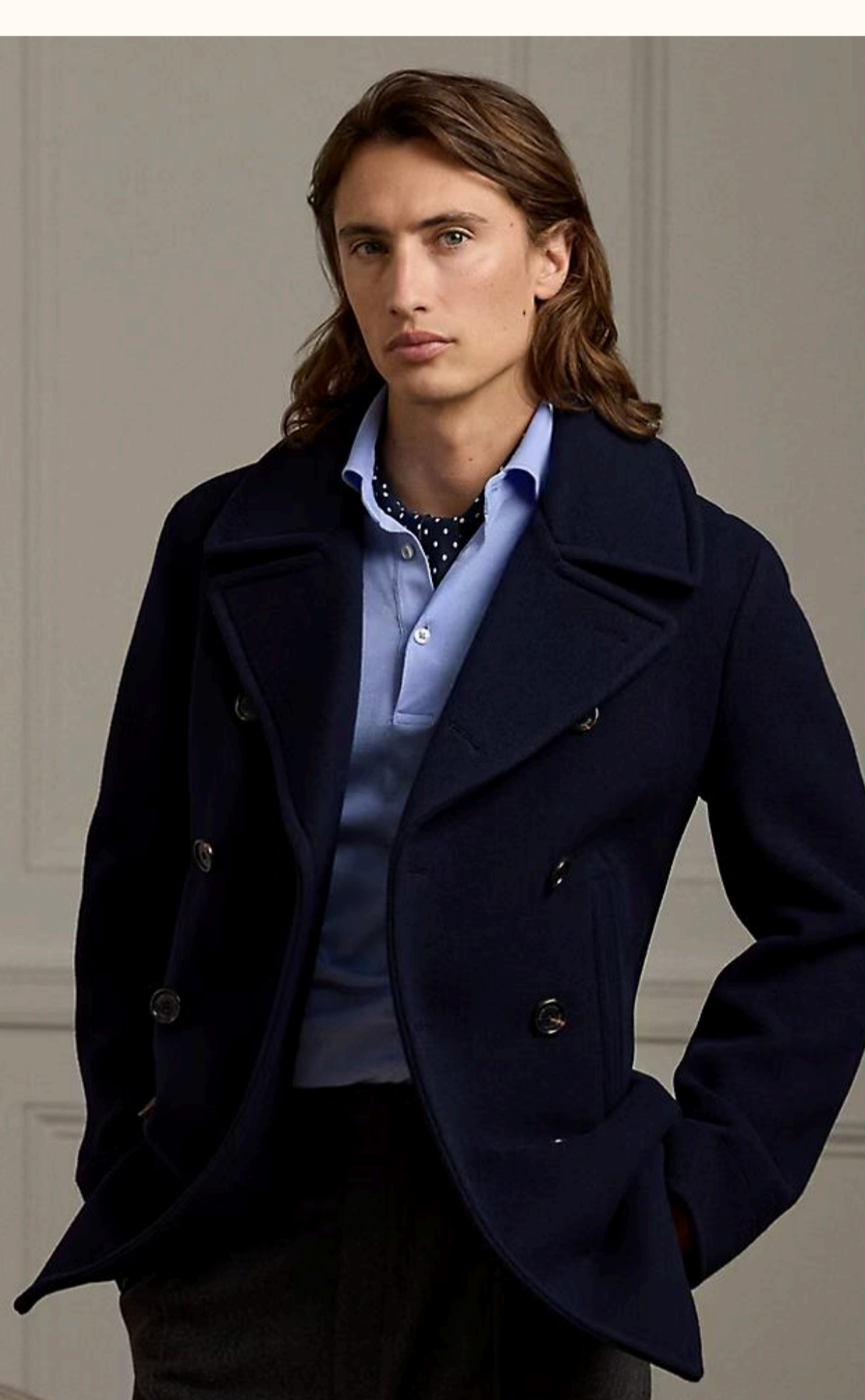
FULLERTON WOOL-CASHMERE PEACOAT €3.950,00