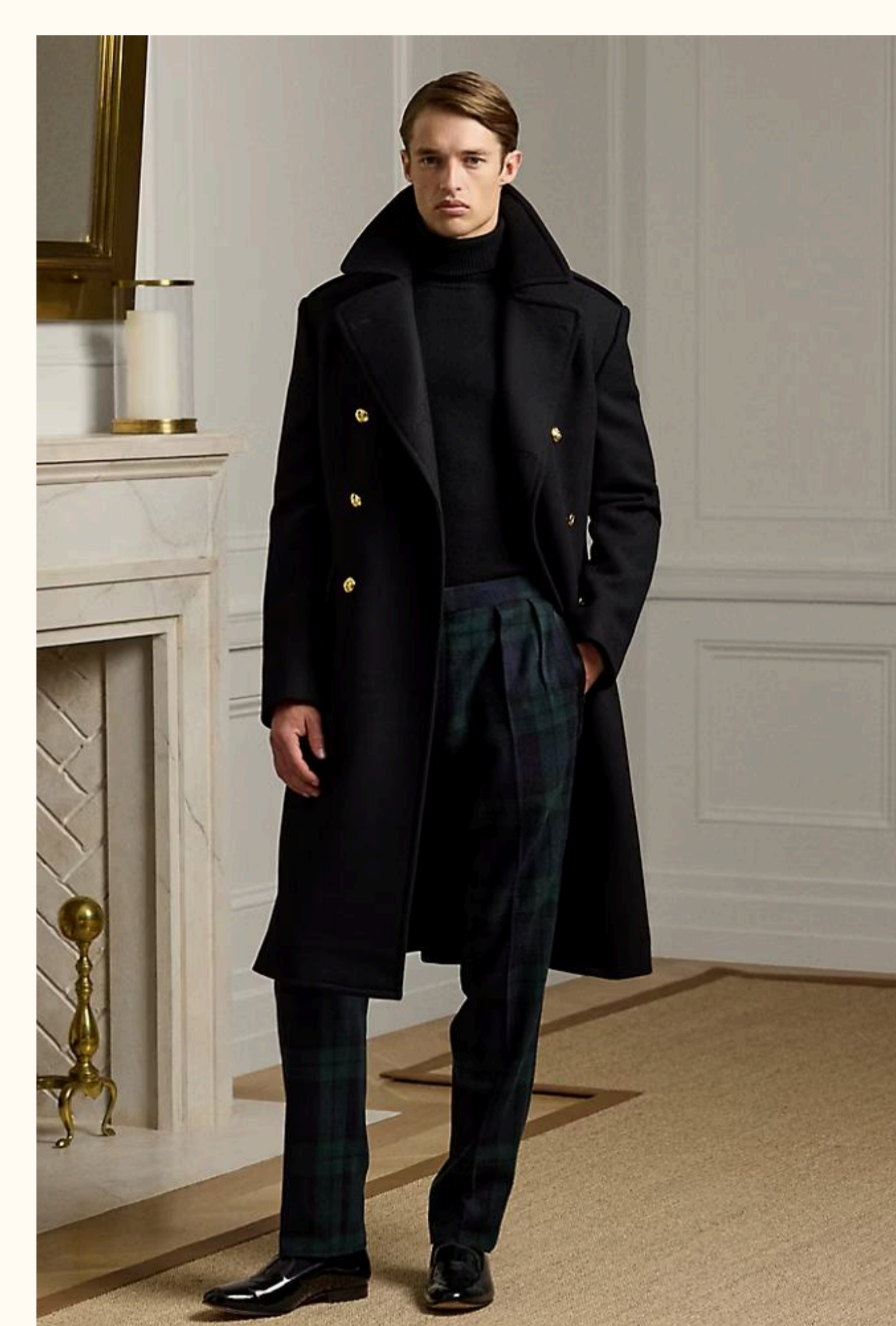
HAND-TAILORED WOOL-CASHMERE TOPCOAT €4.950,00