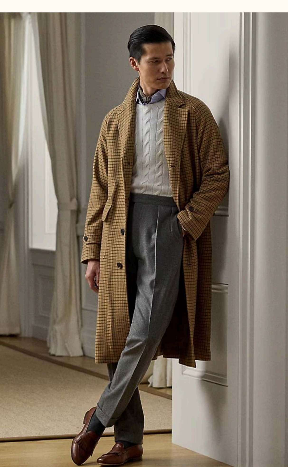
HAND-TAILORED CASHMERE-WOOL TOPCOAT €3.950,00