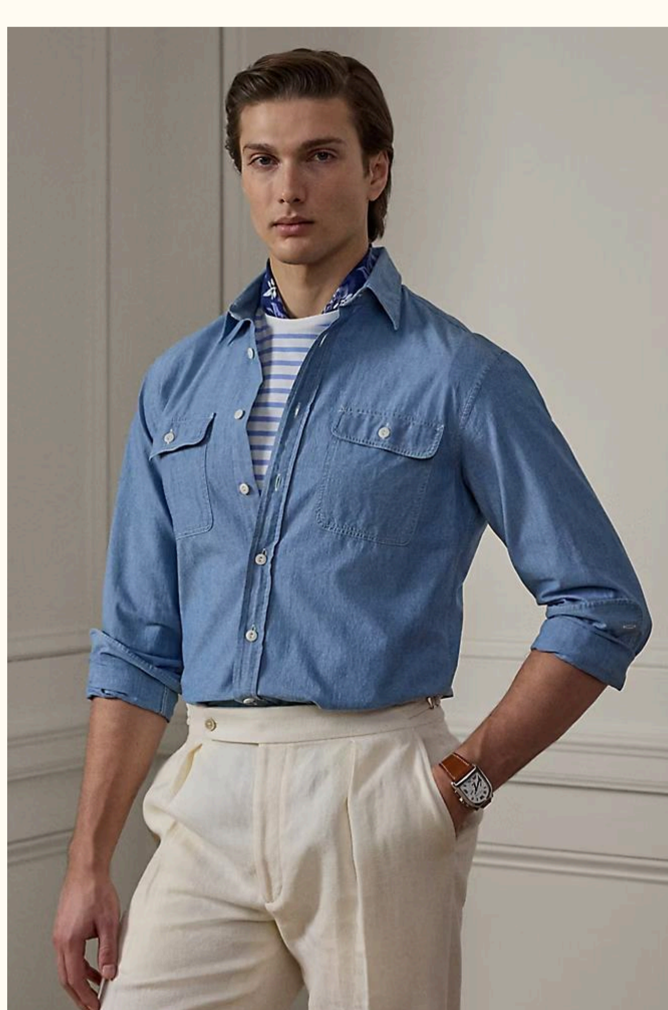
WASHED CHAMBRAY SHIRT €550